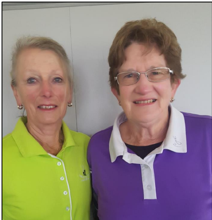
Frances Duffy and Joy Hester