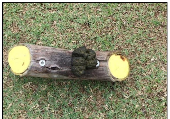
Our resident wombat has made another deposit.