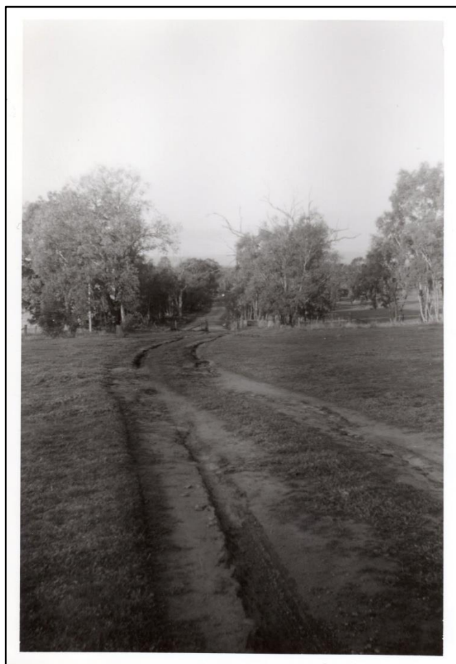
In the 60s the driveway into the course came across the 18th fairway.