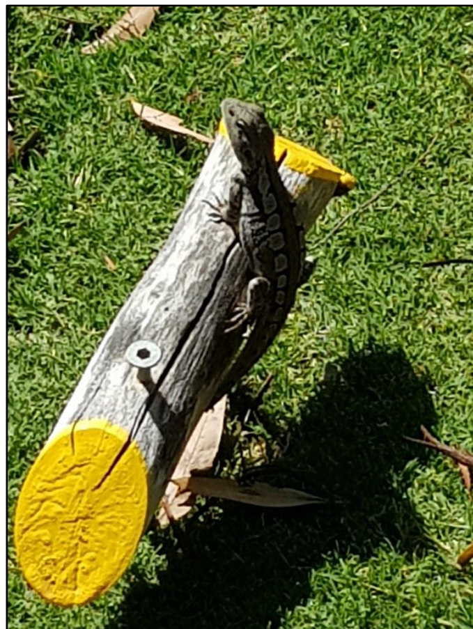
Ladies Closing Day & AGM. attendee Can anyone identify this little guy?