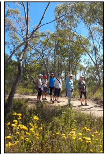
The Warby-Ovens National Parks was covered by a blanket of yellow Shiny Everlasting wild flowers.