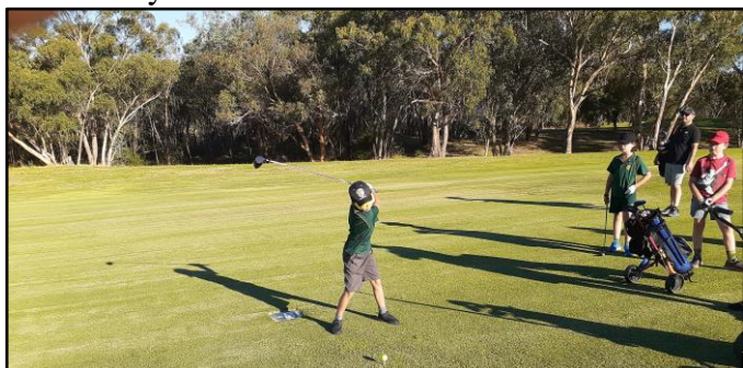
Harry O'Brien in full swing.

The Junior Golf Program is held on Thursdays from 4.00 pm until dark during the winter and from 5.00 pm until 7.00 pm during daylight saving from October until March each year (with the exception of school holidays). The cost per session is $5.00 and is proudly sponsored by McDonald's Wangaratta.