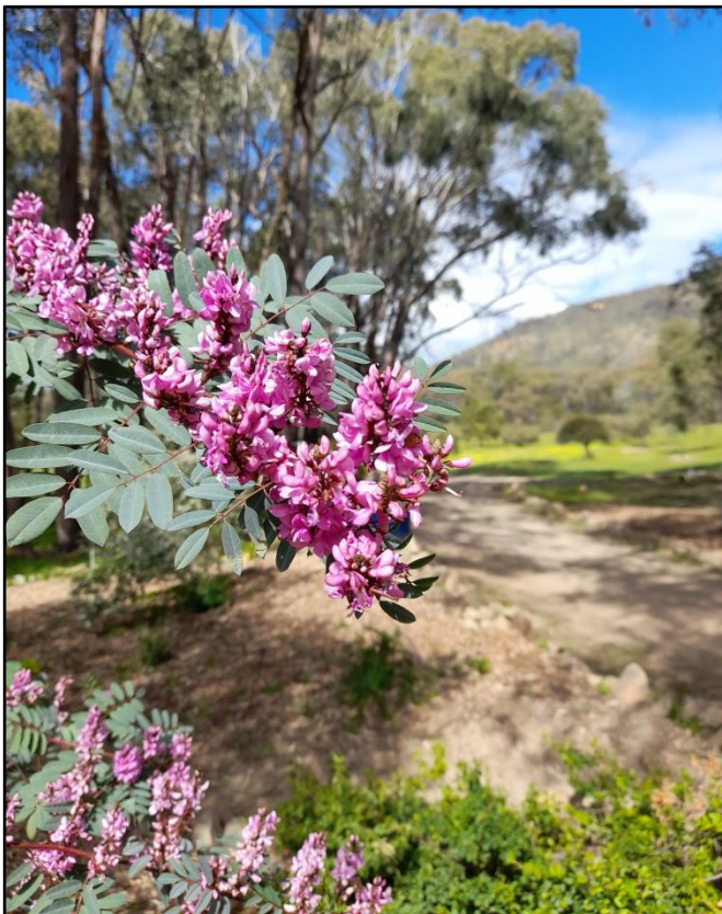
Common Name: Australian Indigo