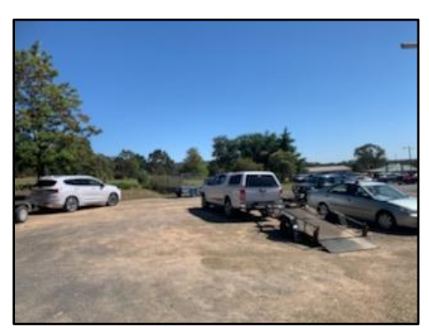
Bays have been drawn on the ground to indicate the required parking spaces for cars with trailer. Please park within the bays so that others can get around the area.