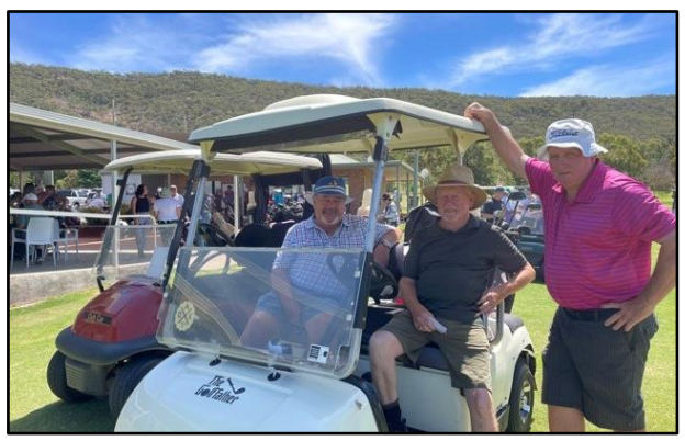
Ready Set Go