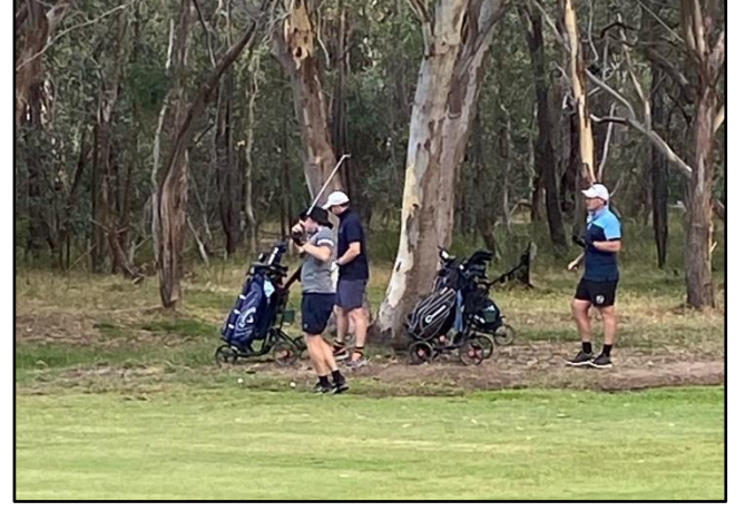
Another team of challengers.