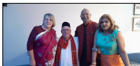
Best Dressed: Di and Fraser