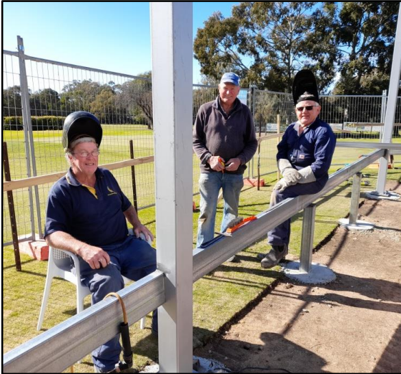
Time for a break on August 2nd.