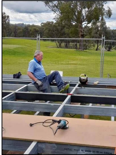
Working on the roof by August 25th.