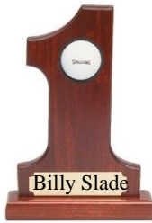
Billy Slade 4 th hole 11 th March