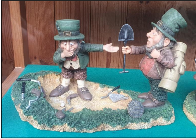
Bringing you the Luck of the Irish with an authentic Bluntstone.