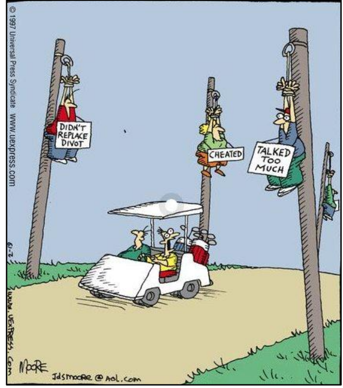
This Club has a well-deserved reputation for insisting on rules compliance.

of the board will be held on Tuesday, the October 17<sup>th</sup> of October at 7.00 pm and any items you want addressed at that meeting should be sent in writing to the secretary.