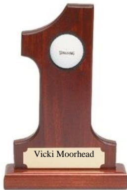
Thurs 16 th Vicki Moorhead 4 th hole

CLUB VOUCHERS ISSUED TO MEMBERS MUST BE REDEEMED WITHIN THE FOLLOWING 12 MONTHS