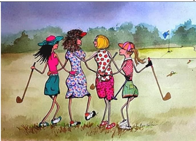
Golfing Goddesses: Sometimes being with your friends and golfing is all the therapy you need. Thanks Ros

In the interests of equity, I am including 2 images that have been shared with me and I hope at least one of them appeals to you.