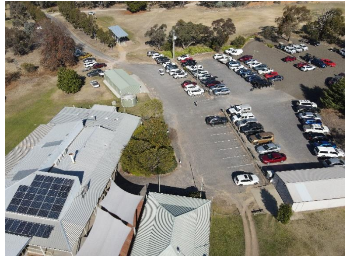
Plenty of cars in the carpark for NEDVGA event

Next event is a 4bbb event at Howlong on last Monday of June. Sheet is up on the board so get a partner and get your names and money in early. Good luck and good golfing until next month.